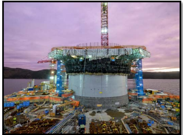
GBS centre shaft slip form pour which brought the total height of GBS structure to 121m