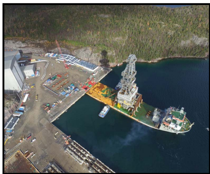
The Derrick Equipment Set (DES) module arriving at Bull Arm after a 59-day voyage from Korea