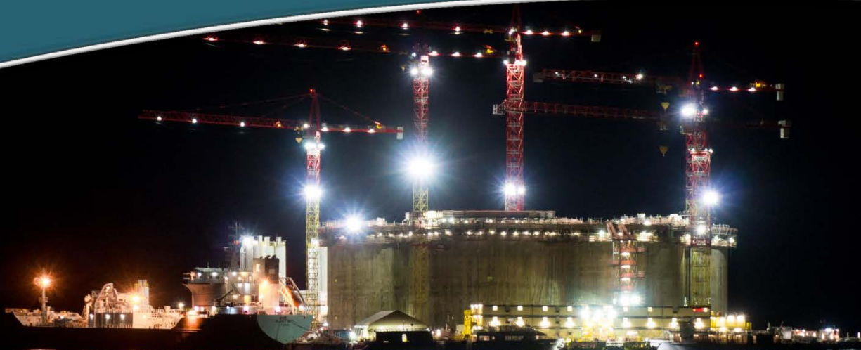
Gravity Based Structure at the deepwater site