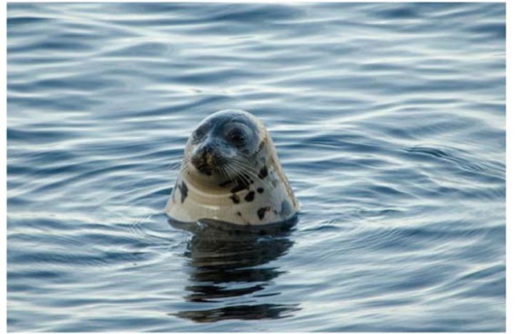
A curious onlooker paused in its daily travels to check out the activities at the deep water site.