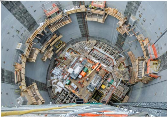
A view down the centre shaft of the Gravity Based Structure where mechanical outfitting will continue for the next several months.