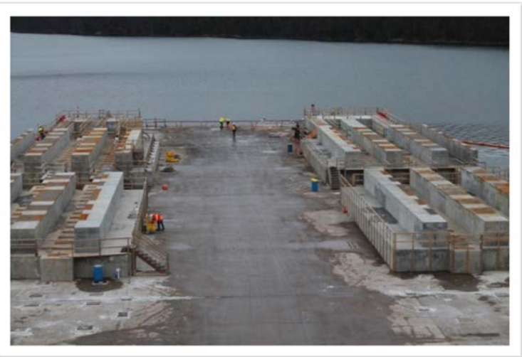
A south view of the integration pier at Bull Arm.