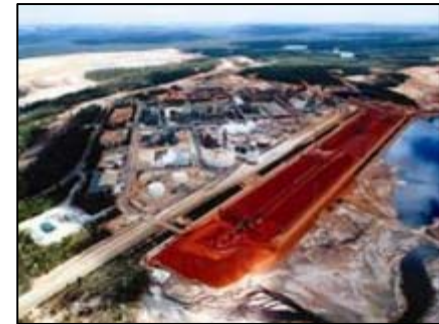
Minerals & Metals